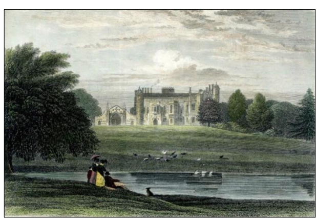
1. Madingley Hall and ornamental lake in 1824

Madingley Hall is an elegant country house built in the 16th Century and owned by the Hynde - and later Hynde Cotton - family until 1871. In 1861 Queen Victoria rented the Hall as a residence for Edward. Prince of Wales whilst he studied at Cambridge. The Hall, with grounds and farmland, was sold to the University of Cambridge in 1948 and is now a continuing education and conference centre.