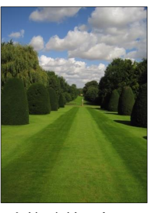
4. North Yew Avenue

Follow the gravel path to a T-junction and then turn right. The path takes a circuit 'all around' the lawns (5) and is in the same location as Brown created it. At the point where the path passes the end of the Yew Avenue (4) there is a gate and stile to access into the Wilderness Grove (6).