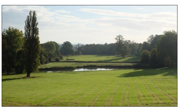
3. East view to the Lake

Cross the forecourt and access the small raised terrace through the wooden gate. Continue around the Hall to the north side and walking along the gravelled terrace above the Croquet Lawn note the view to the north (4). The vista was here when Brown arrived, but he changed the planting, making the Wilderness Grove more informal in appearance. He also added 'clumps' of trees in the distant fields to draw in the wider countryside.